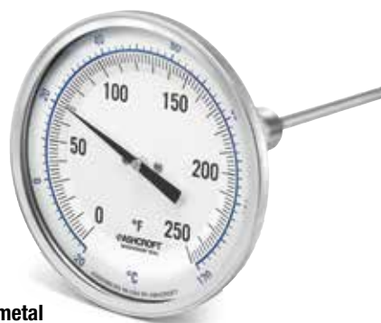
EI Bimetal 3" dial size