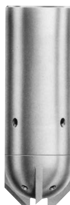
TYPE "S" LUG NOSE