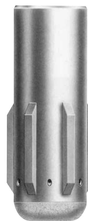
RIBBED DOWN-JET SHOE