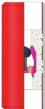
BUTT WELD FLOAT COLLAR WITH SINGLE VALVE S-FCSV-BW-S101-11