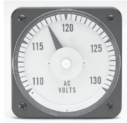
AB-40 Expanded Scale