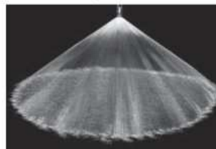
Full Cone 120° (W)

Dimensions are approximate. Check with BETE for critical dimension applications.