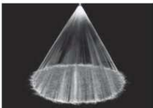
Full Cone 60° (N)

Spray pattern: Full Cone with uniform distribution. For square patterns, please contact BETE. Spray angles: 60°, 90°, and 120° standard Flow rates: 2.01 to 2150 gpm (Higher flow rates available)