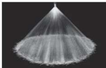
Full Cone 90° (M)