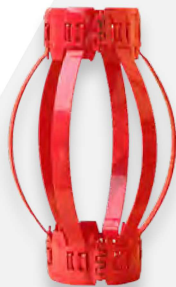
Single bow hinged non-welded centralizer